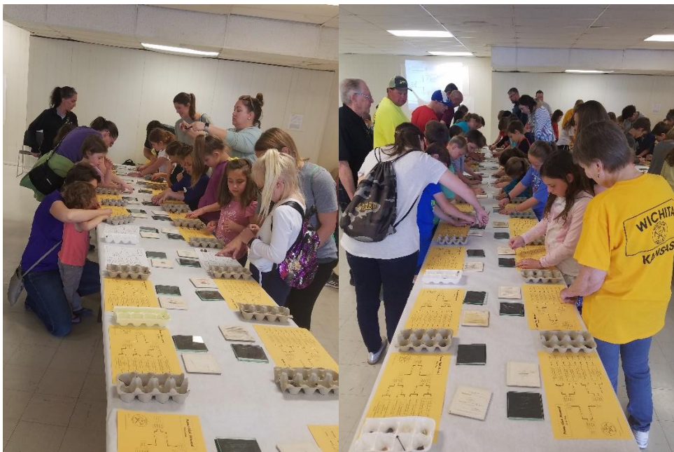
Education day at the show.