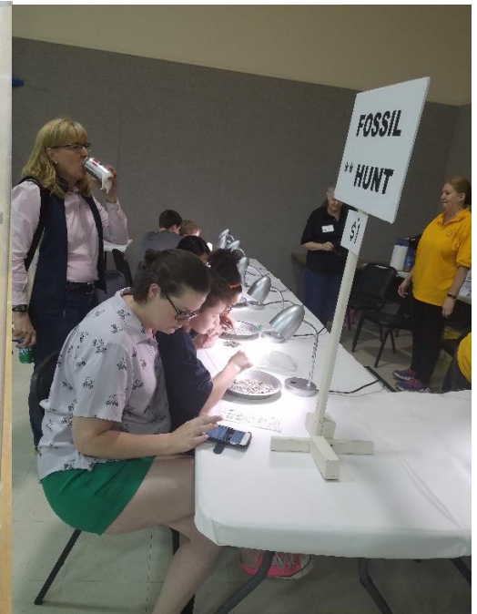
Silent auction; San Juan Gems; Geode anticipation; Geode after broken; Pigs at show, Fossil Hunters